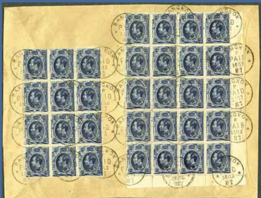
One of the highlights of the collection, 1883-85 1 solot indigo a block of twelve and a block of twenty used on the reverse half of an envelope (below).