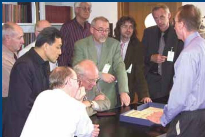
Members of the Thailand Philatelic Society visit the British Library.