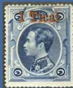
1885-87 1 Tical on 1 solot indigo, variety surcharge double, once in red and once in black, (SG 7e), unused.

For details of the Thailand Philatelic Society please contact: