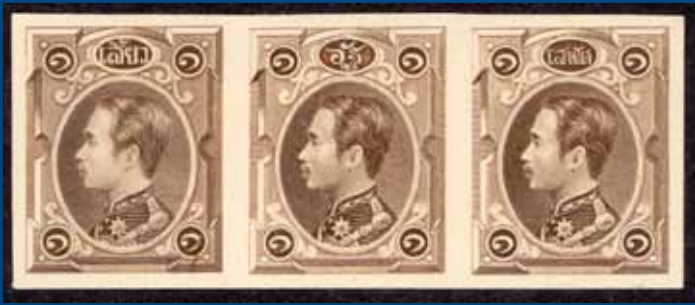
1883-85 1 solot colour proof strip of three.