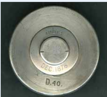
India 1878 Queen Victoria Head Die.

Any philatelist interested in the Indian Postal Service and Mail between Britain and the regions, east of the Cape, where the East India Company traded, must eventually have recourse to the vast records in the India Office collection. For instance, if you collect or study ship letters carried on the Company's ships then the many thousand captains logs of almost every voyage made by an East India Man in the archive are available for study and the extracting of vital information on the progress of the voyage. From 1813 the Company's monopoly of trade east of the Cape was restricted to the China trade and trade with India was open to anyone. With the loss of this monopoly the