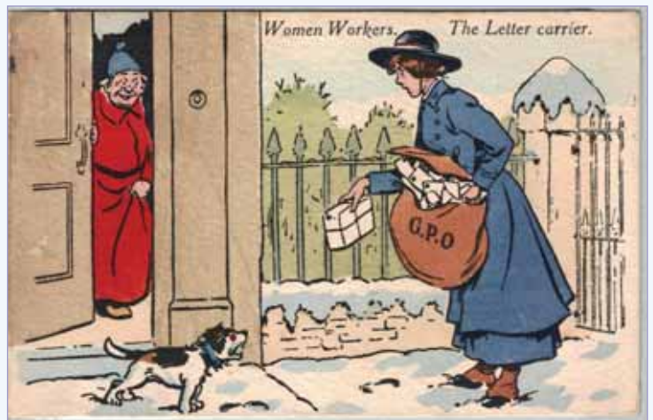
Postcard showing the importance of women in the war effort in WWI.

The donor has prepared a PowerPoint presentation and lecture script that will be available, to any societies or interested groups of people. "The idea of the PowerPoint presentation is to alert people to the vast resources of the British Library and in particular the Philatelic Collections which can be used both for research, education and personal entertainment in the broadest sense. I want those seeing the presentation to be encouraged to use the BL and also to get interested in a subject such as the history of the Post Office or the development of an art form with words that is accessible to most people."